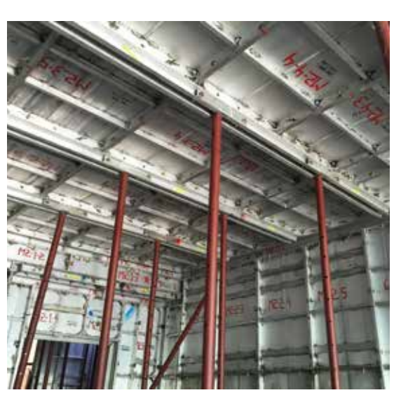
▲ Build smart - Doka Aluminum Formwork System produced by MFE allows highly cost-effective forming achieved by an adaptive and logical system concept

MFE formwork is easily adapted to all types of concrete forming requirements, from office towers, hotels and up-market high-rise condominiums, to single and double story homes and affordable housing projects.