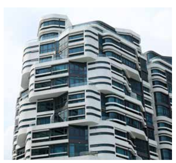
▲ Multi generational and harmonious residential sanctuary, where a cycle time target of 5 days per floor was achieved due to the formwork solution.