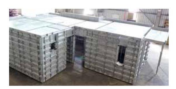
▲ Doka Aluminum Formwork System produced by MFE is a high-performing formwork designed to cast walls and foor-slabs quickly in a single pour