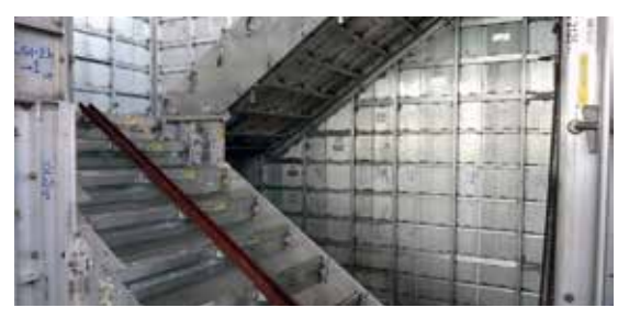
▲ Thanks to test assembly we can ervery time ensure the correct setup of the system - especially for special areas like as staircases, special shaped walls, etc.