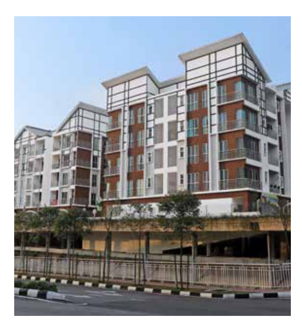
▲ Cameroon Highlands, Summer Square comprising ground floor and 4 storey low rise apartment buildings with retail at ground level. Retail units cast first and apartment floors completed at a rate of one floor every 5 days.